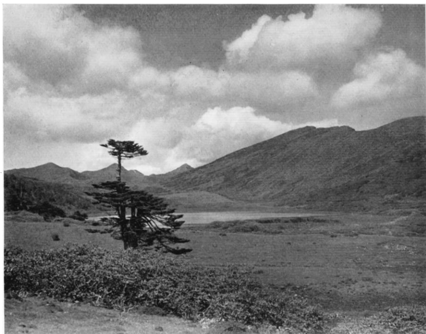
Orka La: the last tree