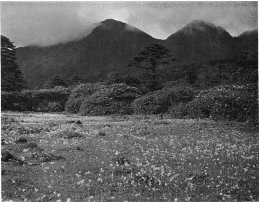
Meadows of Primula Dickieana at 13,000 feet