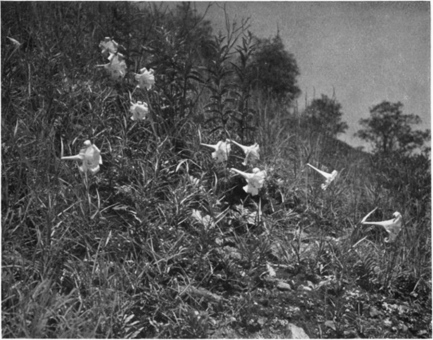
Lilium Wallichianum , above Dirang Dzong